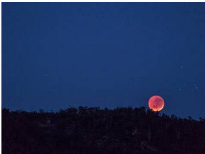
Lela's winning photo

In the early morning of 27/07/18, much of the world was treated to a total lunar eclipse with Australia in a ring side seat. Luckily the Bega skies were clear and the ground not too frosty. It was certainly worth getting out of bed early to watch the long lasting spectacle as the earth's shadow slowly covered the moon and turning it blood red, with Mars at its brightest and hovering in frame.