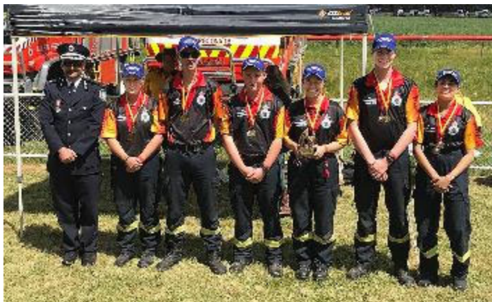
Team members came from Brogo, Bemboka, Buckajo, Candelo, Angledale and Jellat Jellat

Two teams of Bega High School students representing the Bega Valley Rural Fire Service have performed well at the recent Holbrook Field Days.