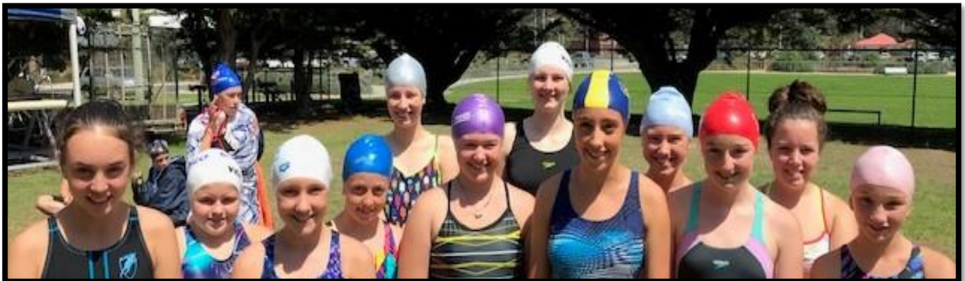
Girls Relay Teams