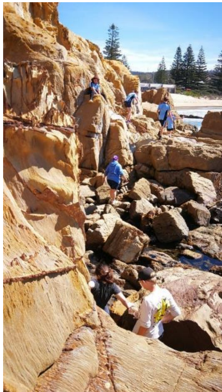
Tathra Bushwalking returning to Tathra Beach from Shelly Beach